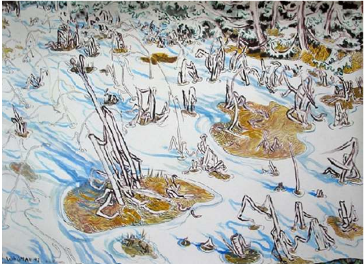
Bullrushes, Flesherton, 1992 watercolour on paper, 41 x 56.5 inches, studio work