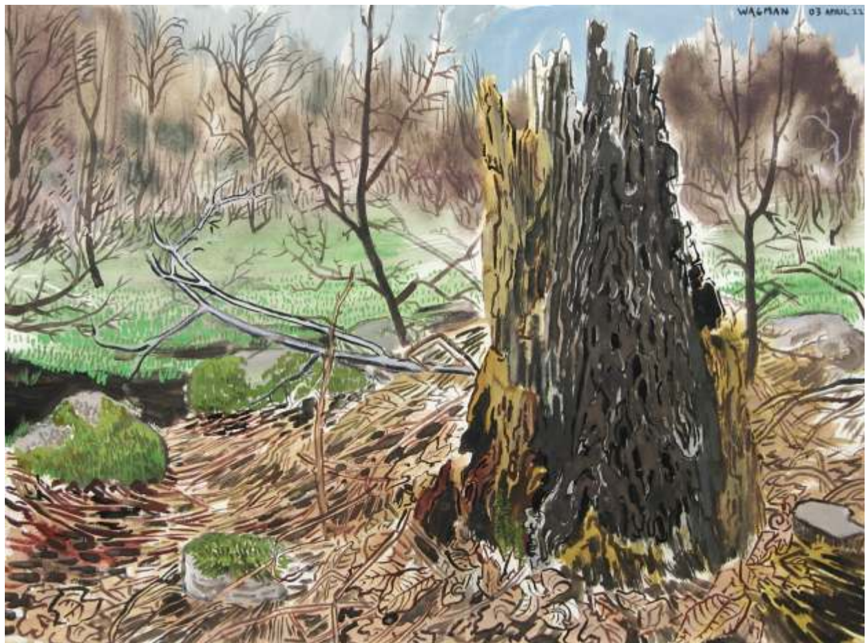
Stump , 2003 watercolour on paper, 18 x 24 inches, plein air work