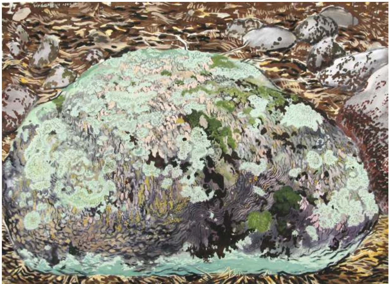
Rock With Lichens , 2004 watercolour on paper, 18 x 24 inches, plein air work