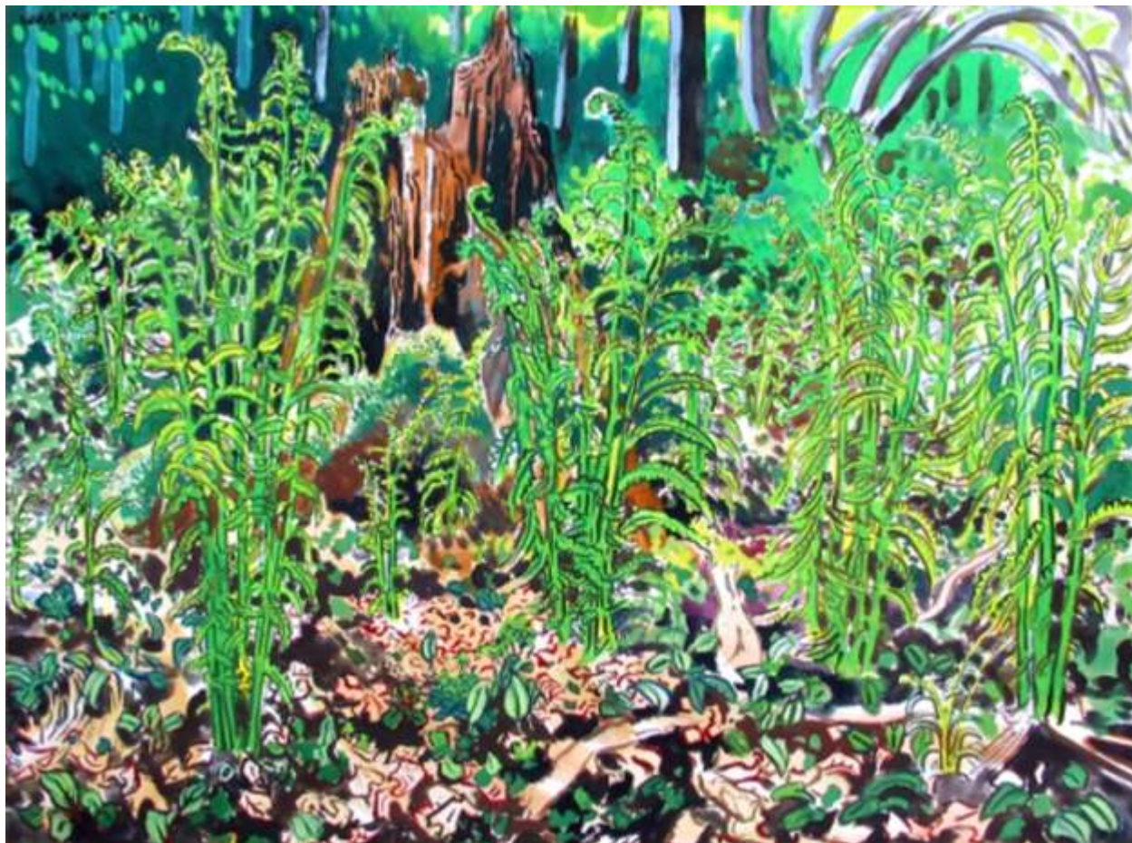
Ferns With Stump , 2007 watercolour on paper, 22 x 30 inches, plein air work