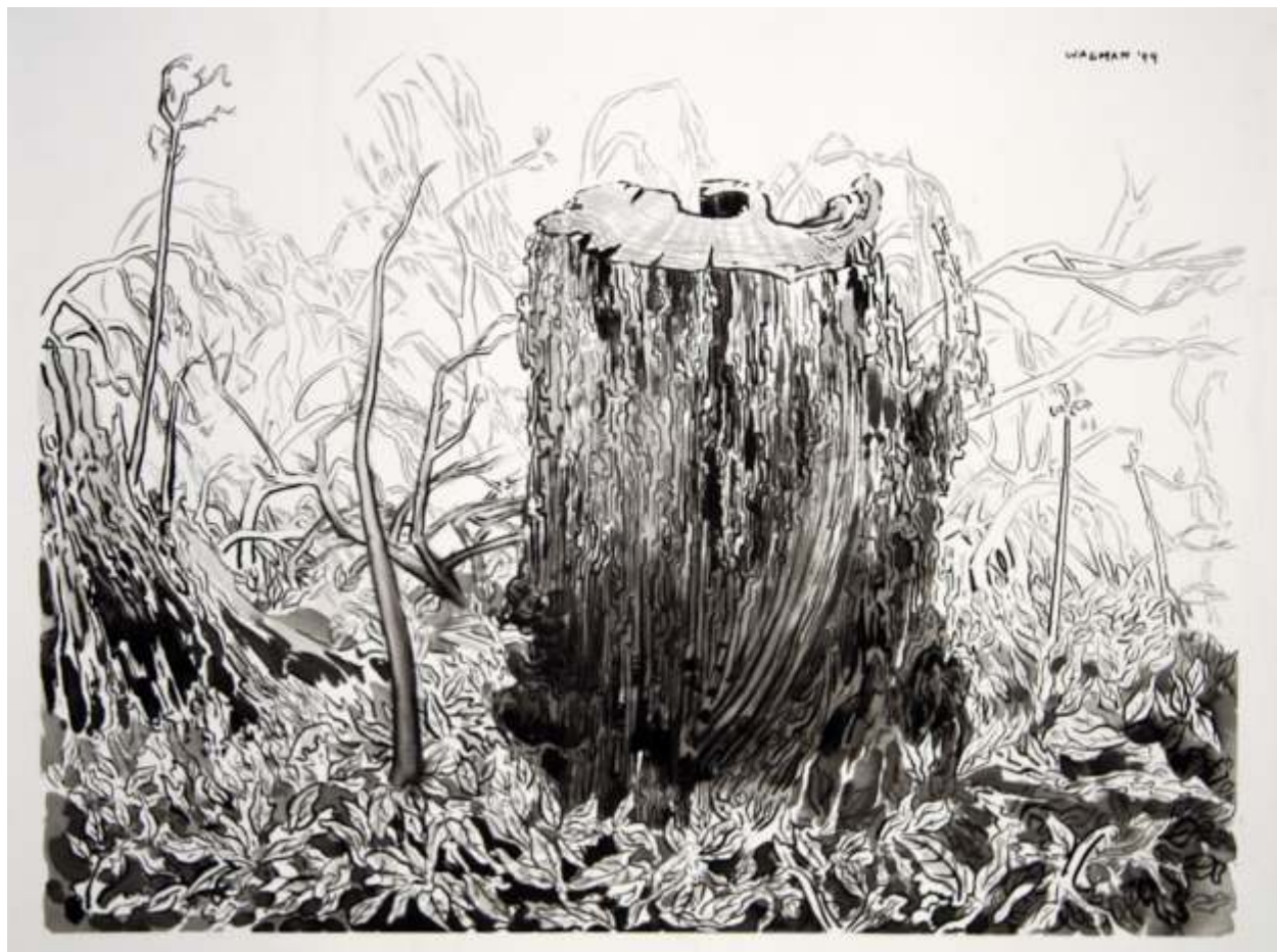
Old Stump , 1999 ink on paper, 32 x 43 inches, studio work