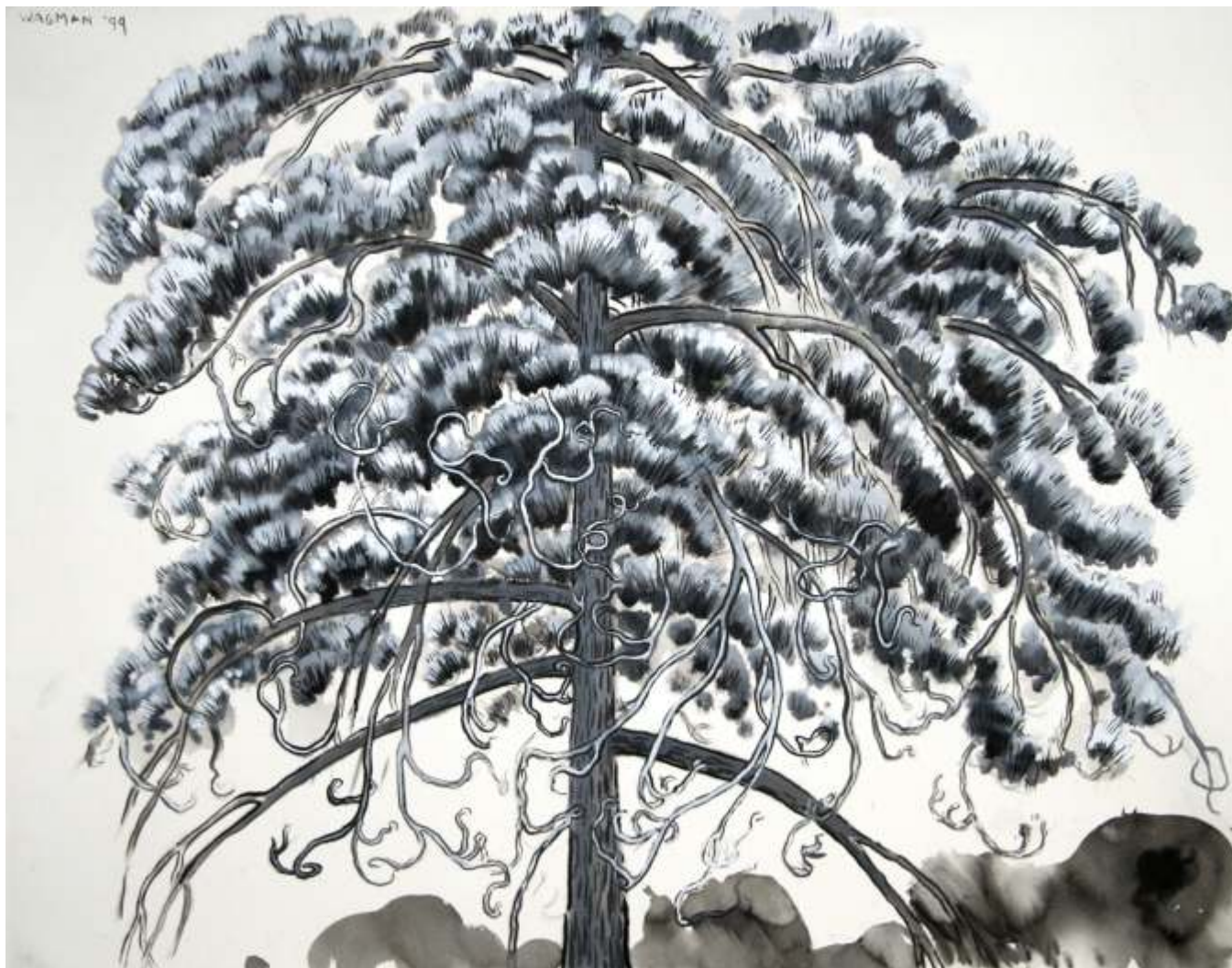
Pine Tree , 1999 ink & watercolour on paper, 35 x 45 inches, studio work