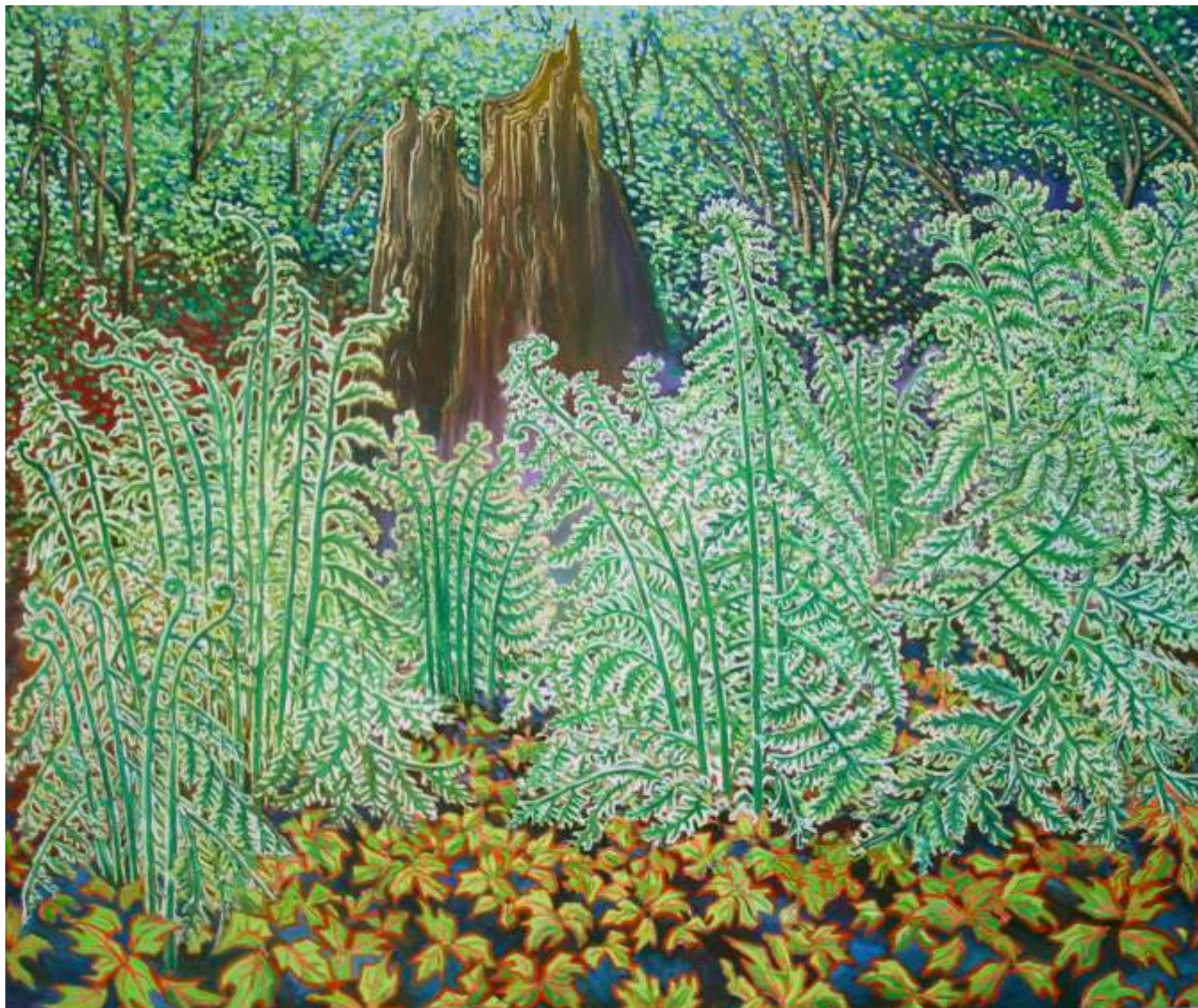
The Rights of Spring , 2008 oil on canvas, 60 x 72 inches, studio painting