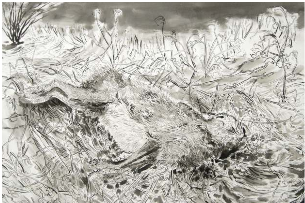
Dead Rabbit , 2005 ink on paper, 22 x 30 inches, plein air work