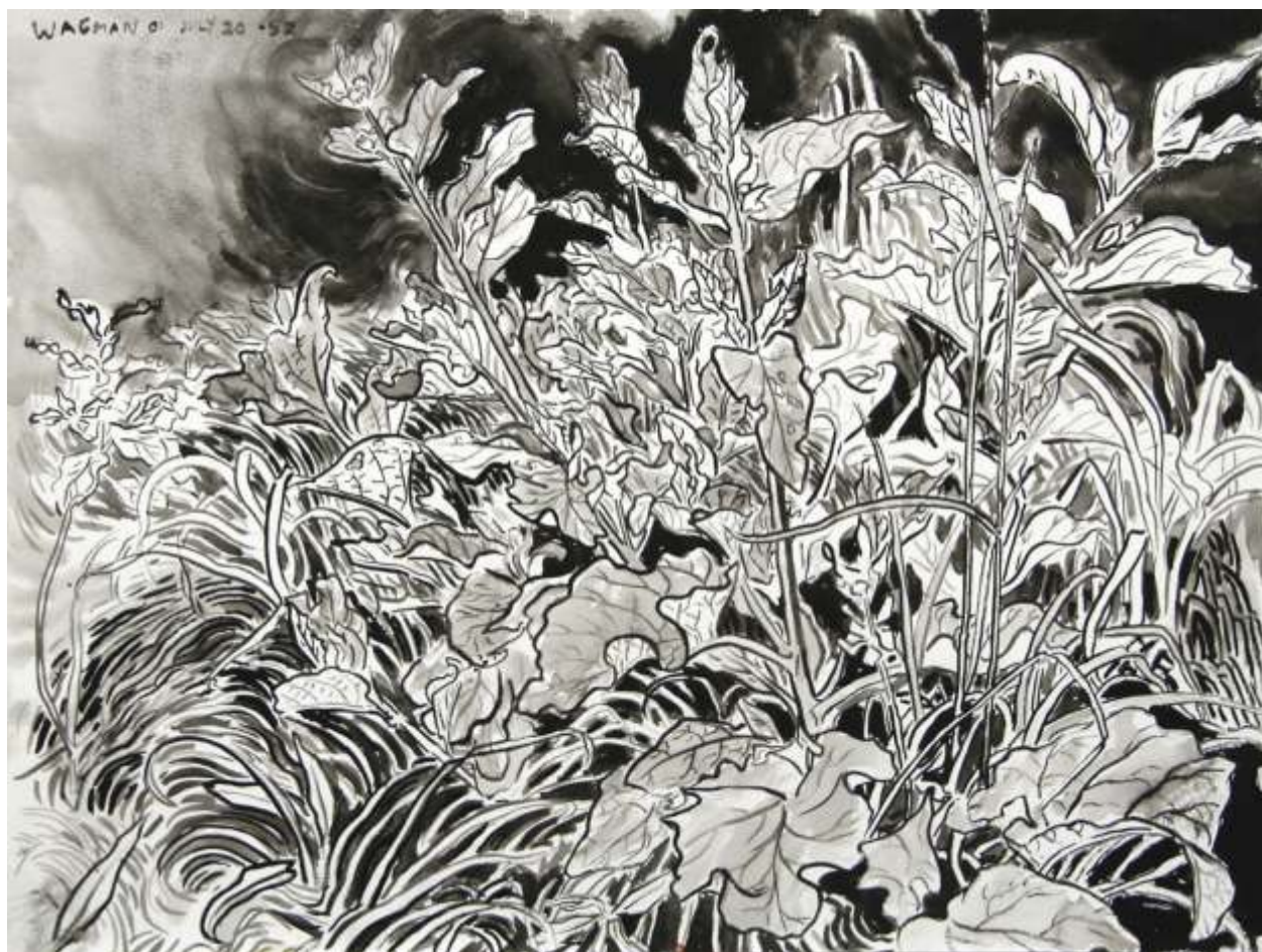
Burdock , 2001 ink on paper, 18 x 24 inches, plein air work