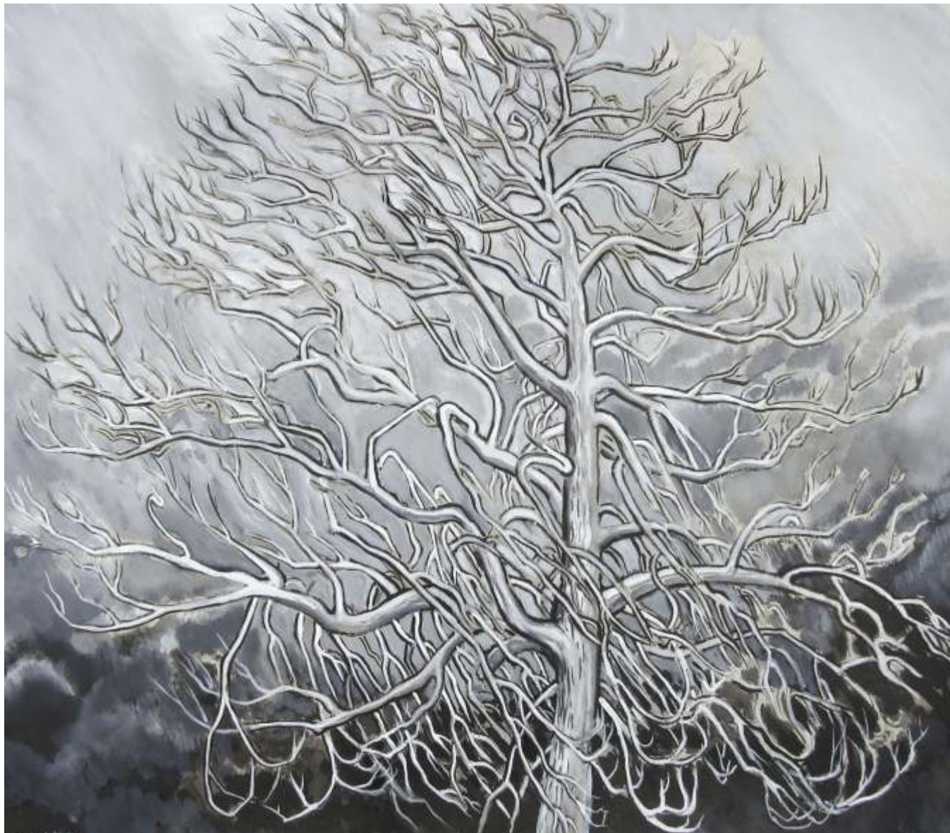
Bare Tree , 1998

ink & watercolour on paper, 31 x 35 inches, studio work