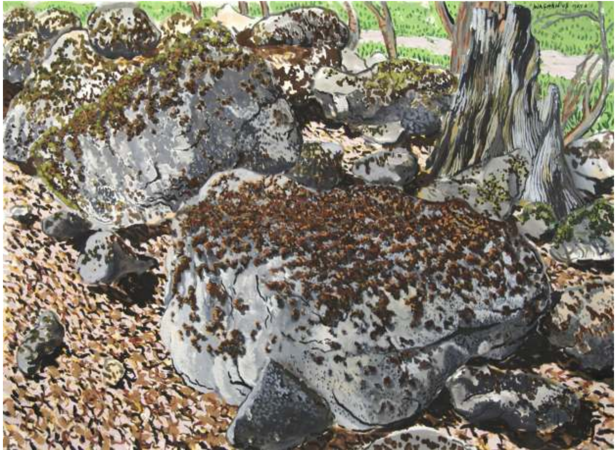
Rock & Moss , 2005 watercolour on paper, 22 x 30 inches, plein air work