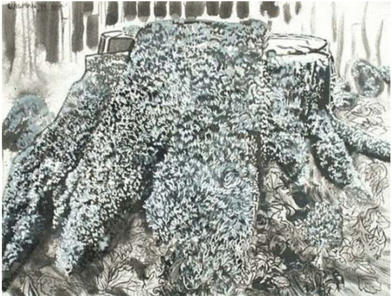
Mossy Stump , 1999 ink & watercolour on paper, 39 x 48 inches, studio work