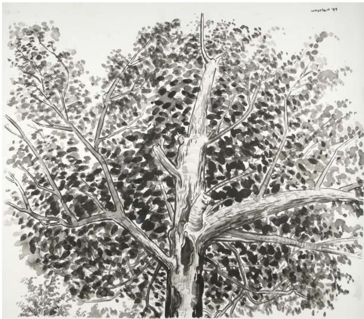
Maple Tree , 1999 ink & watercolour on paper, 29 x 34 inches, studio work