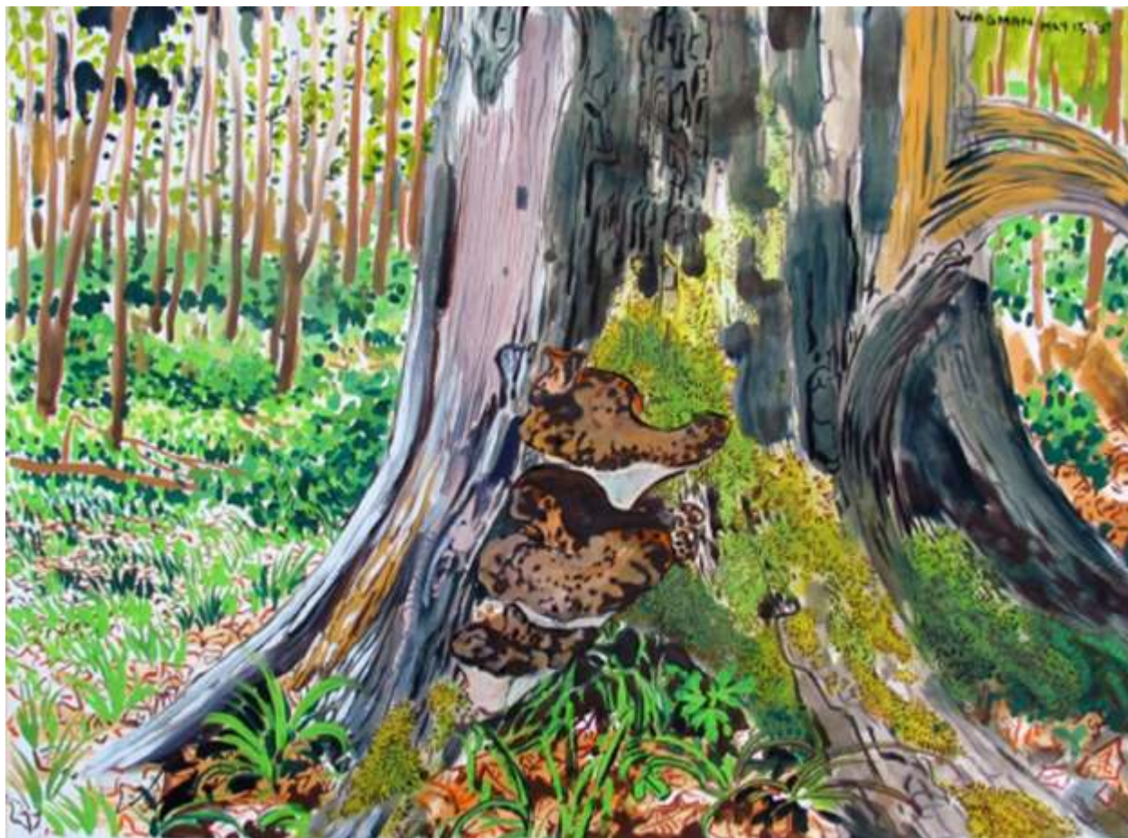
Fungi , 2007 watercolour on paper, 22 x 30 inches, plein air work