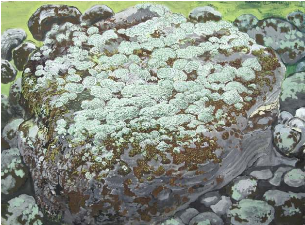
Rock & Lichens , 2002 watercolour on paper, 22 x 30 inches, plein air work