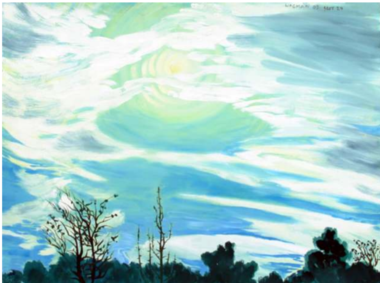
Mid Morning , 2003 watercolour on paper, 22 x 30 inches, plein air work