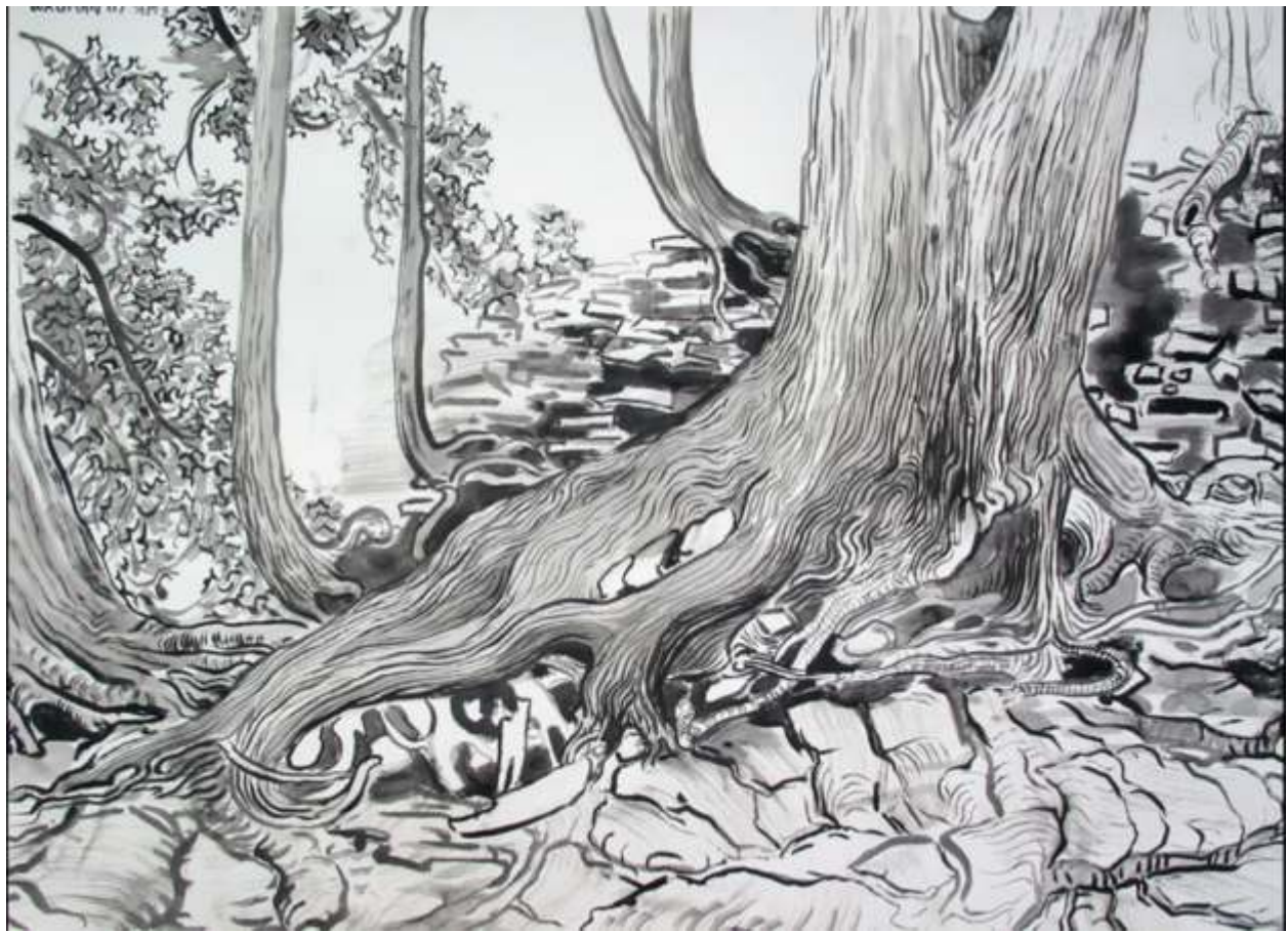
Root at Jones's Falls , 2007 ink on paper, 22 x 30 inches, plein air work