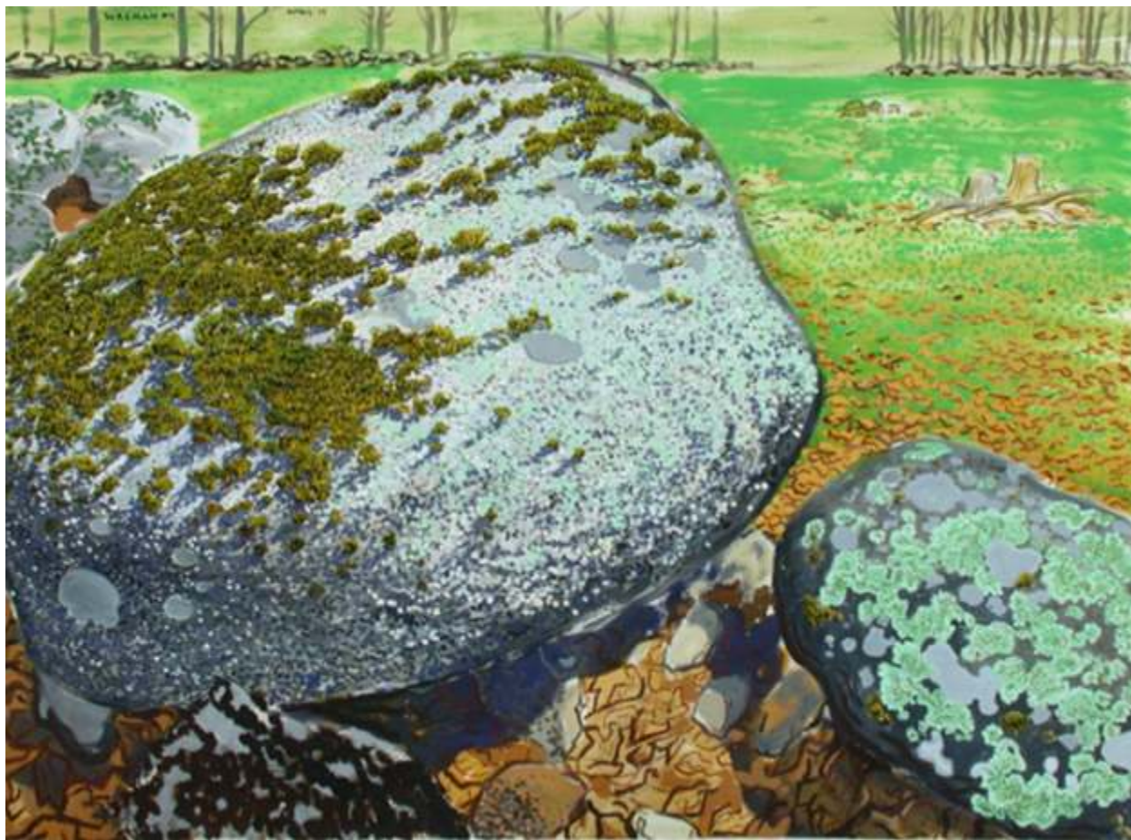
Two Rocks , 2004 watercolour on paper, 25.5 x 37 inches, plein air work