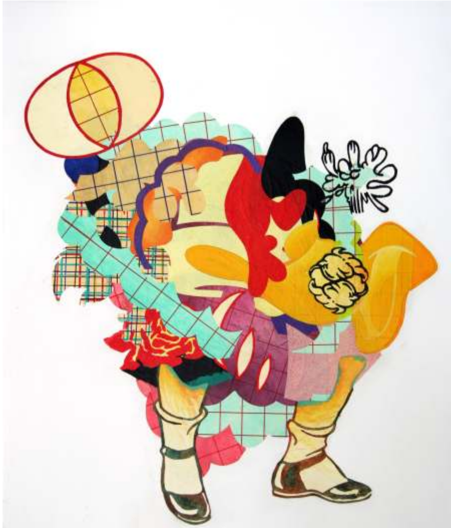
Collage Bag #2 collage on paper, 24 x 20 in 2006