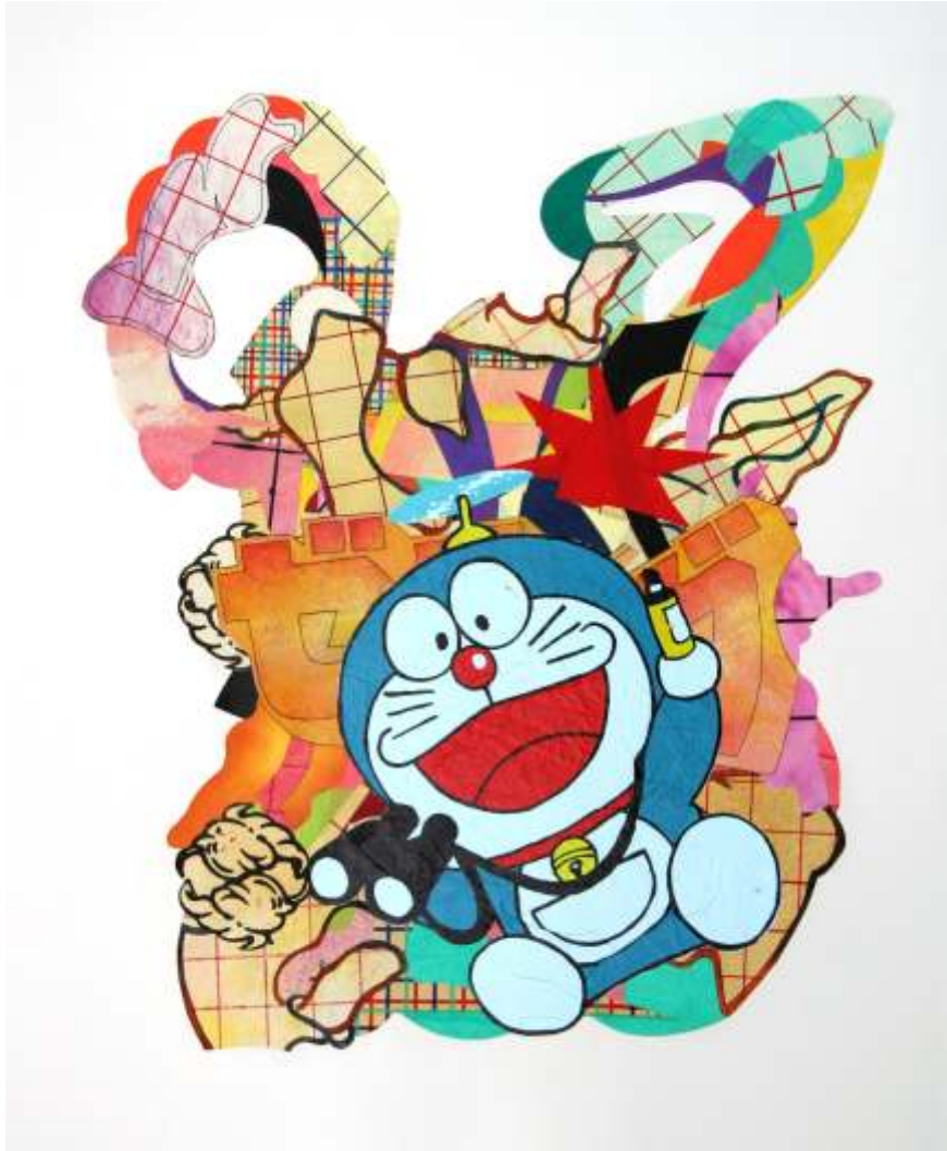
Collage Bag #4 collage on paper, 24 x 20 in 2006