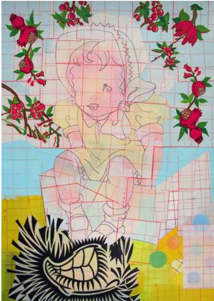
Girl In A Box collage on paper, 29 x 23 in 2005