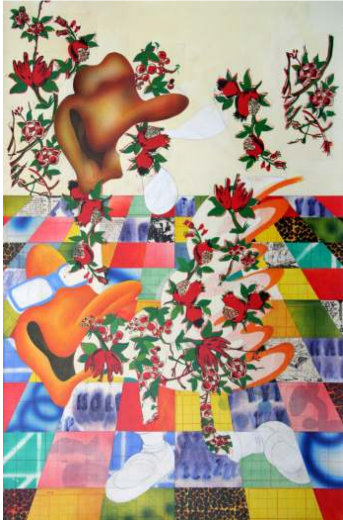
Dux collage on paper, 41 x 28 in 2006