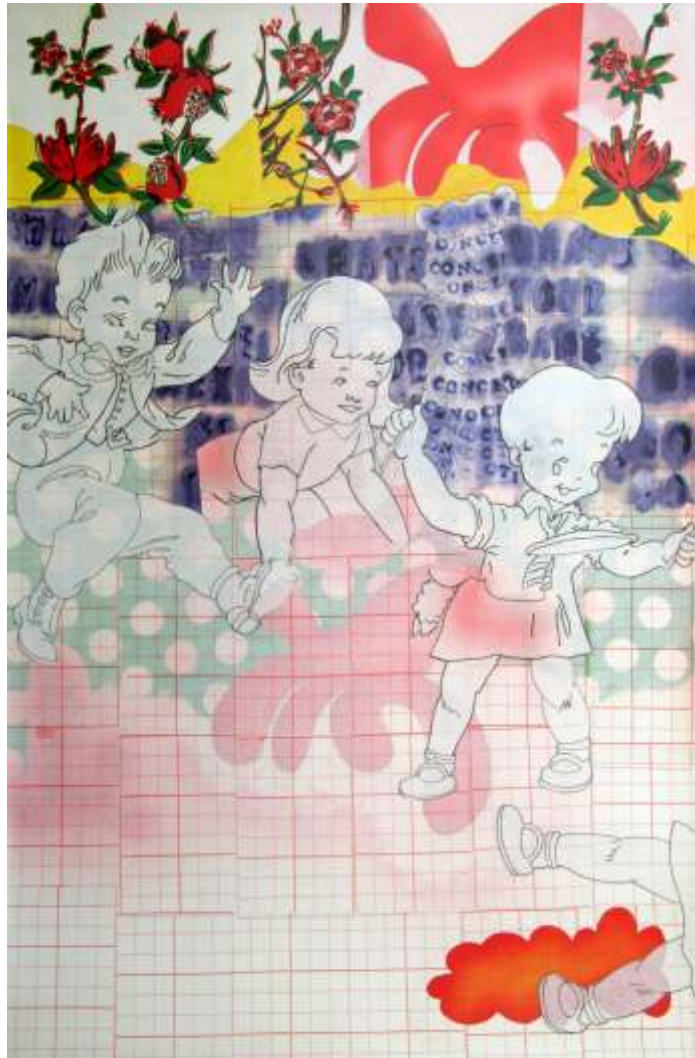
Kids collage on paper, 41 x 28 in 2002