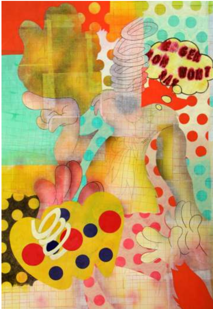
Finger & Spring collage on paper, 41 x 29 in 2006