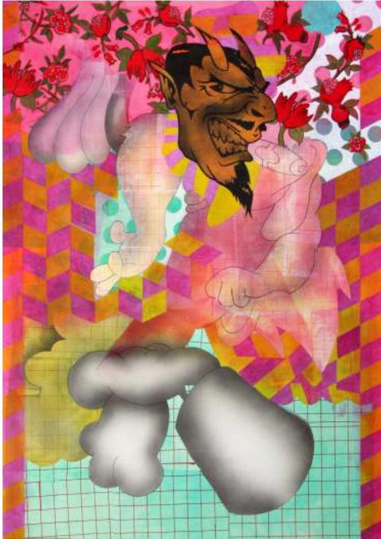
Untitled Devil collage on paper, 40 x 29 in 2006