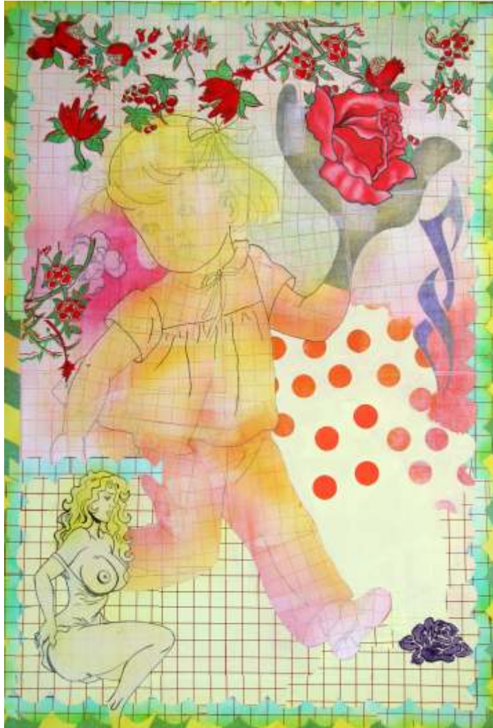
Girl With Rose collage on paper, 47 x 31 in 2006