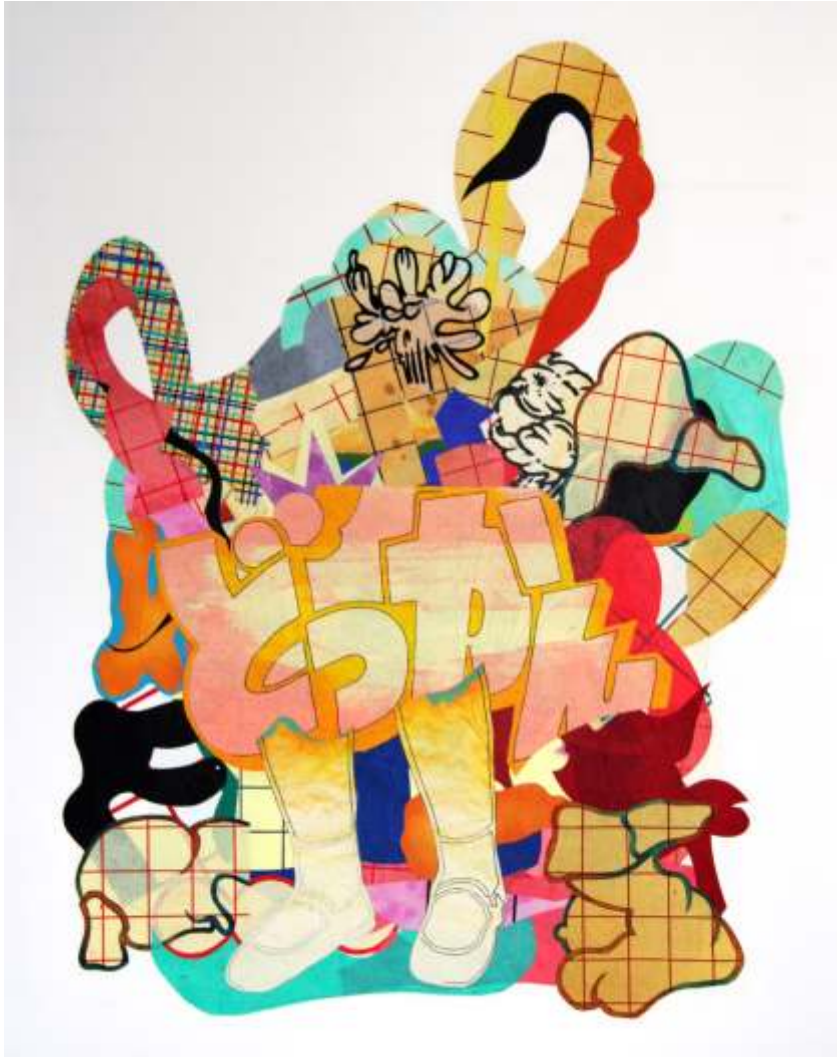
Collage Bag #3 collage on paper, 24 x 20 in 2006