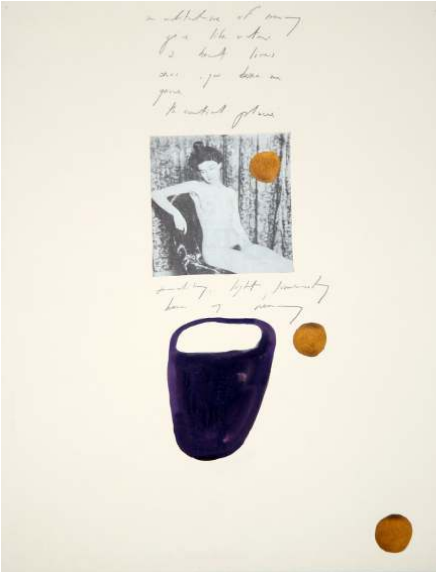
From The Erotic Notebook - Paris collage, gouache, pencil 25.5 x 20 in 1995