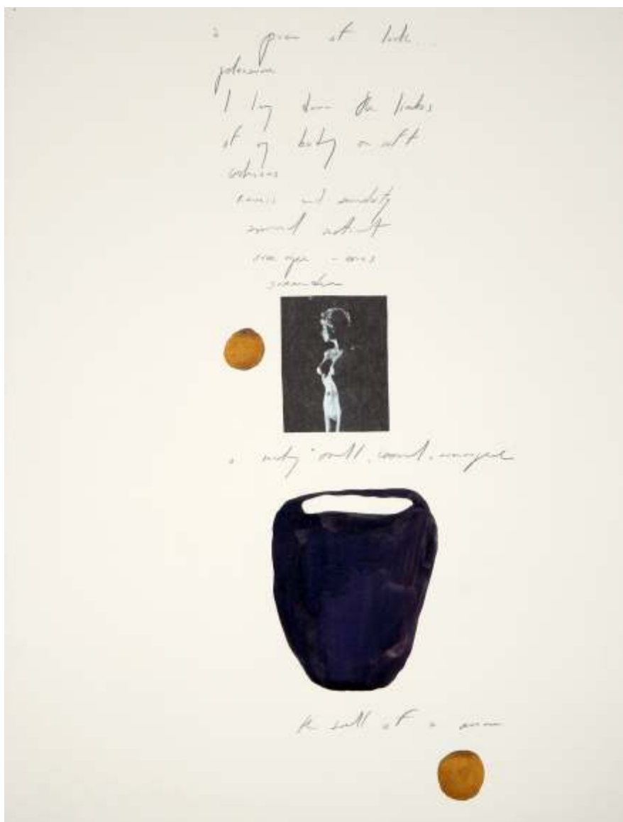
From The Erotic Notebook - Paris collage, gouache, pencil 25.5 x 20 in 1995