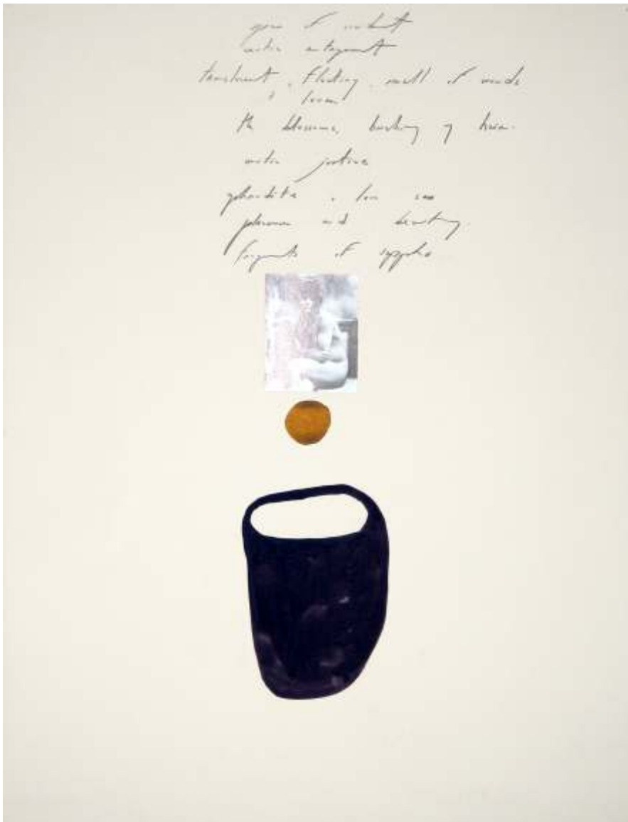
From The Erotic Notebook - Paris collage, gouache, pencil 25.5 x 20 in 1995