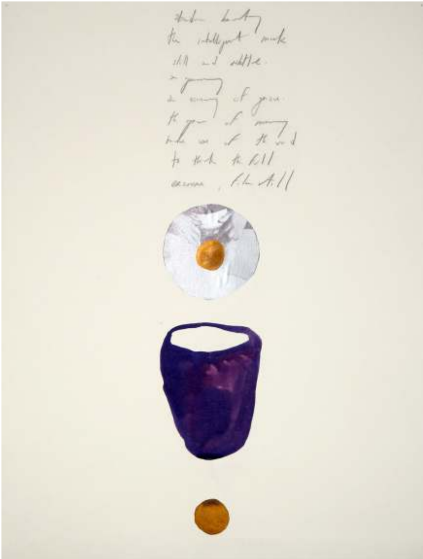
From The Erotic Notebook - Paris collage, gouache, pencil 25.5 x 20 in 1995