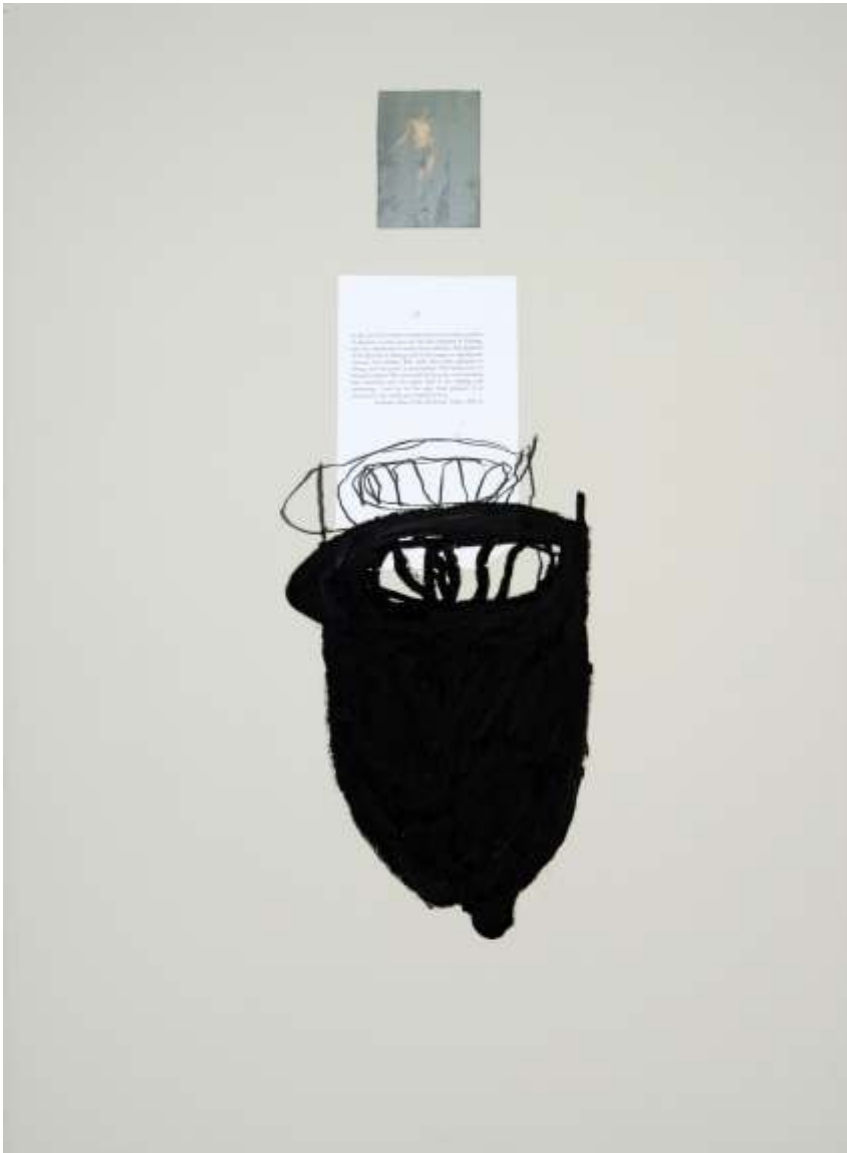
From The Erotic Notebook - New York collage, crayon, oilstick 30 x 22 in 2004