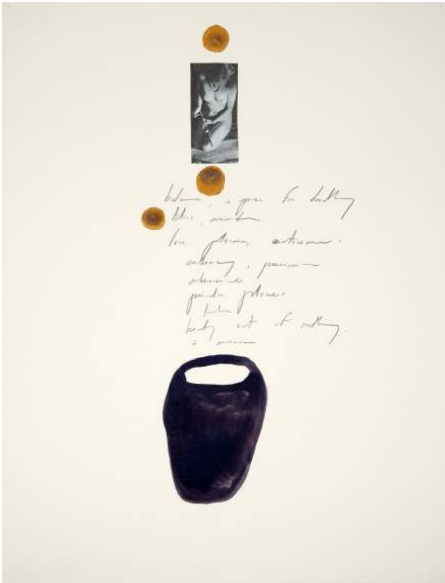
From The Erotic Notebook - Paris collage, gouache, pencil 25.5 x 20 in 1995