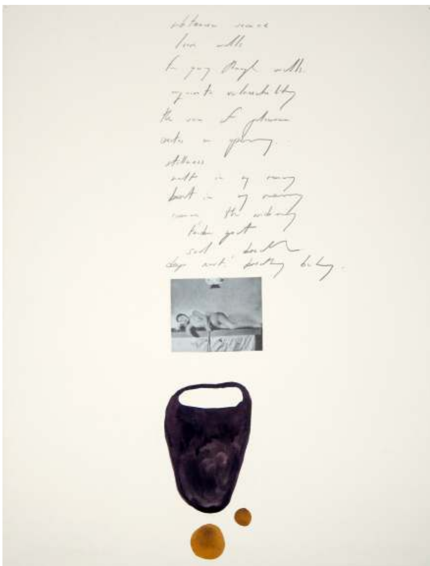
From The Erotic Notebook - Paris collage, gouache, pencil 25.5 x 20 in 1995