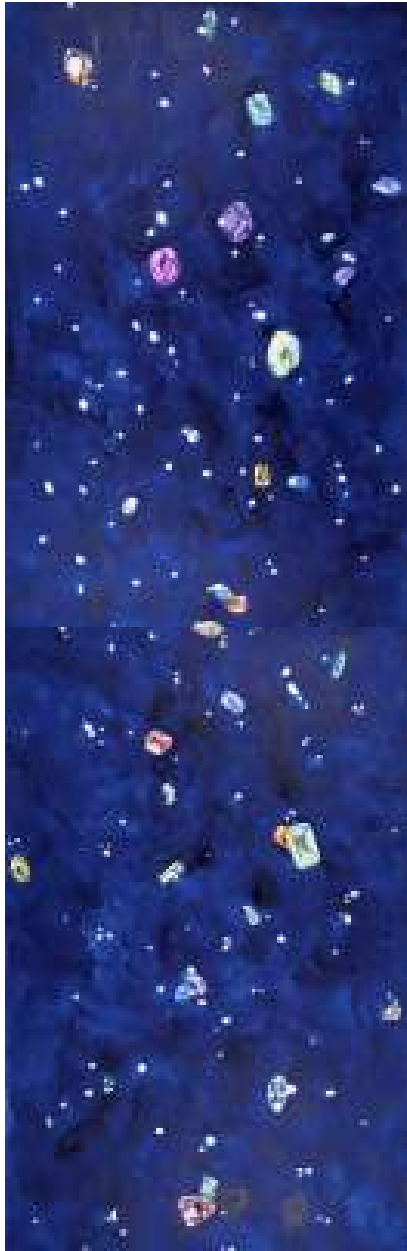
Night Gems watercolor on paper, two panels 79x26 in 1996