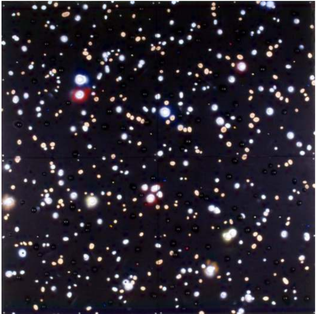
Star Field in Sagittarius, 2003 10x10' (4-5x5' panels) wood balls, glass and acrylic gems, silicon, krylon and acrylic paints on black gessoed plywood