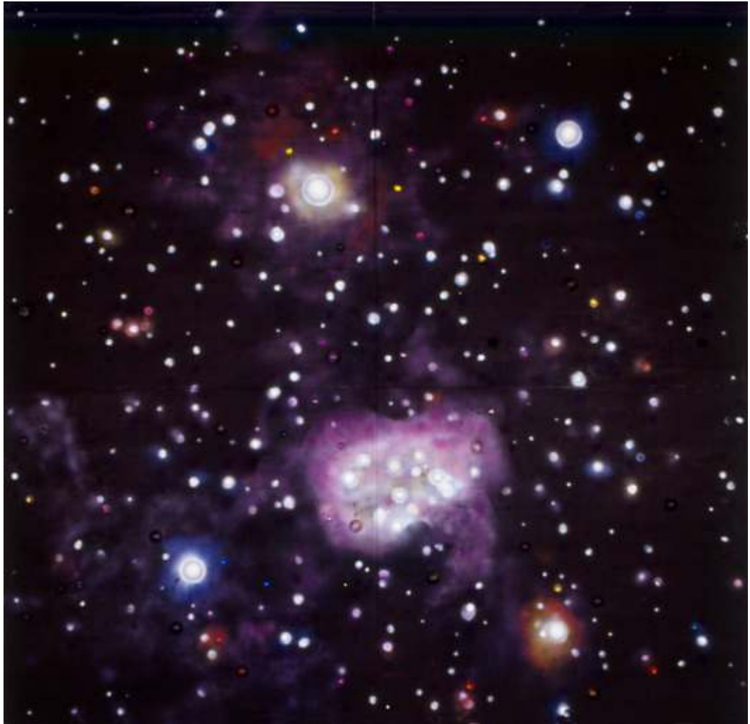
DLM L 106, 2003 10x10' (4-5x5' panels) wood balls, glass and acrylic gems, silicon, krylon and acrylic paints on black gessoed plywood.