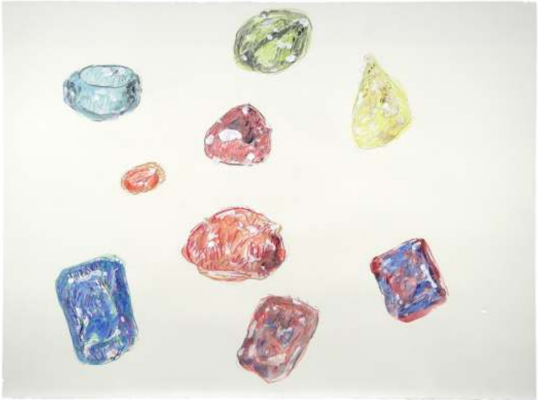
Gems watercolor and pencil on paper 22.5x30 in 1996