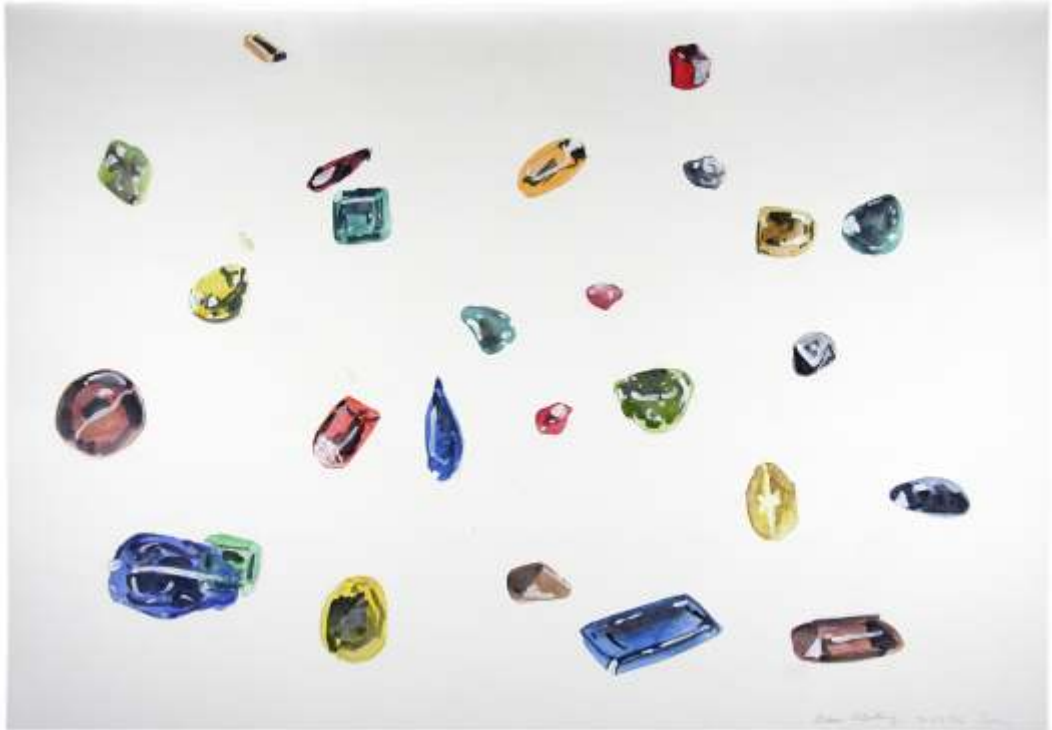
Gems Floating watercolor on paper 22.5x30 in 1996