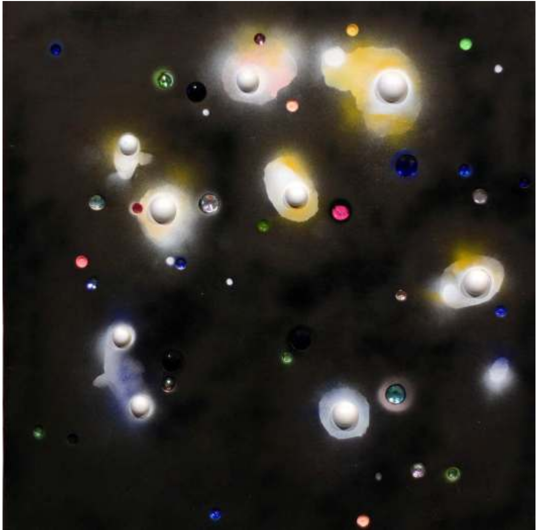
Space Edge Painting 1, 2004 36x36" wood balls, glass and acrylic gems, silicon, krylon and acrylic paints on black gessoed plywood.