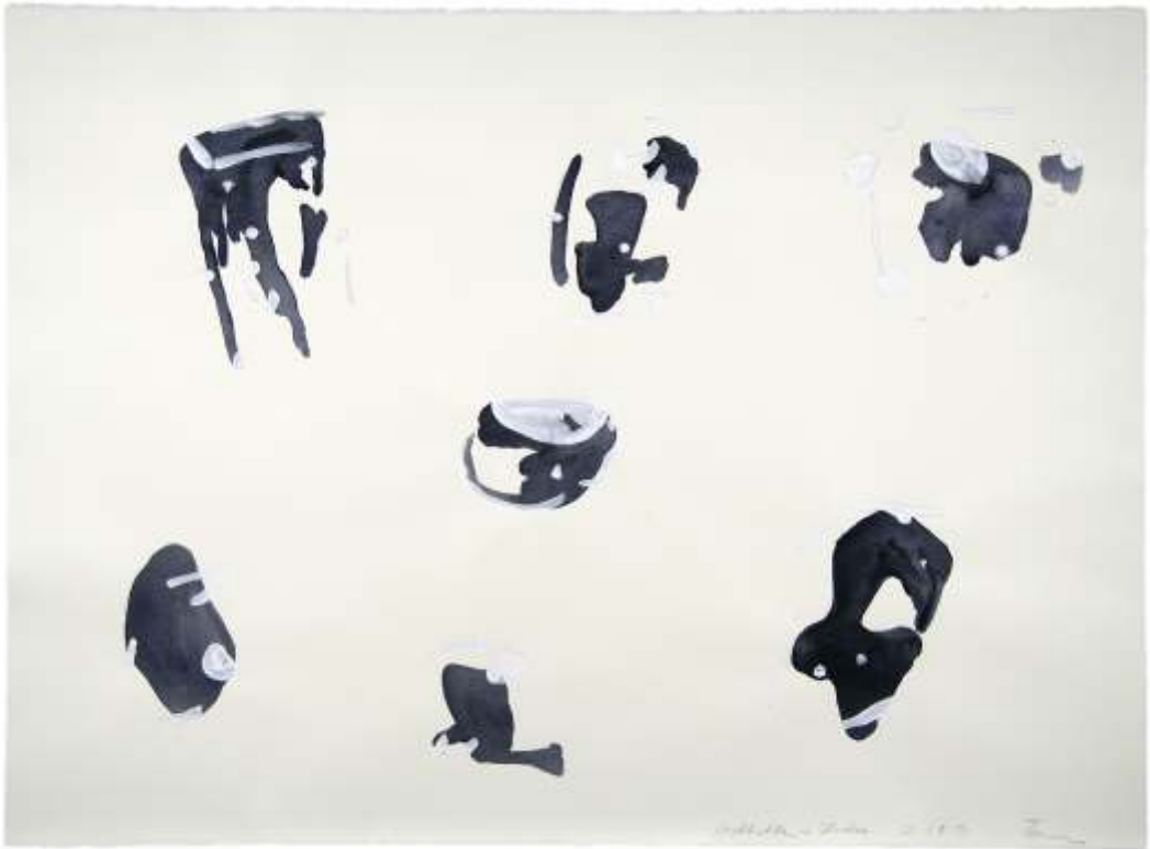
Highlights and Shades watercolor on paper 22.5x30 in 1996