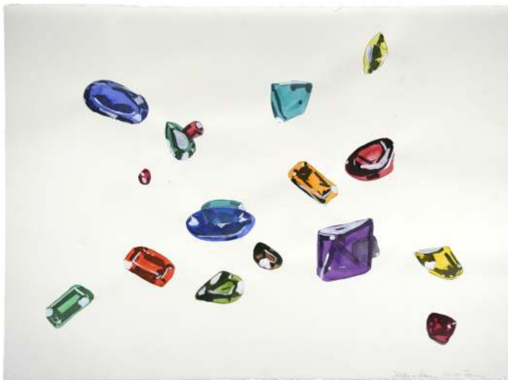
Floating Gems watercolor on paper 22.5x30 in 1996