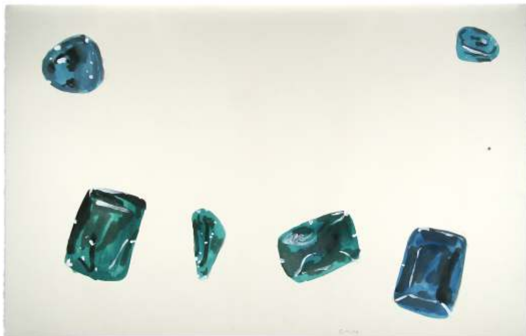
Emeralds watercolor on paper 26x41 in 1996