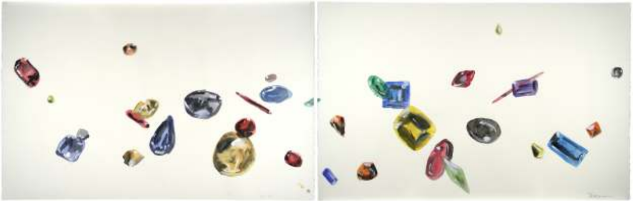
Day Gems watercolor on paper, two panels 79x26 in 1996