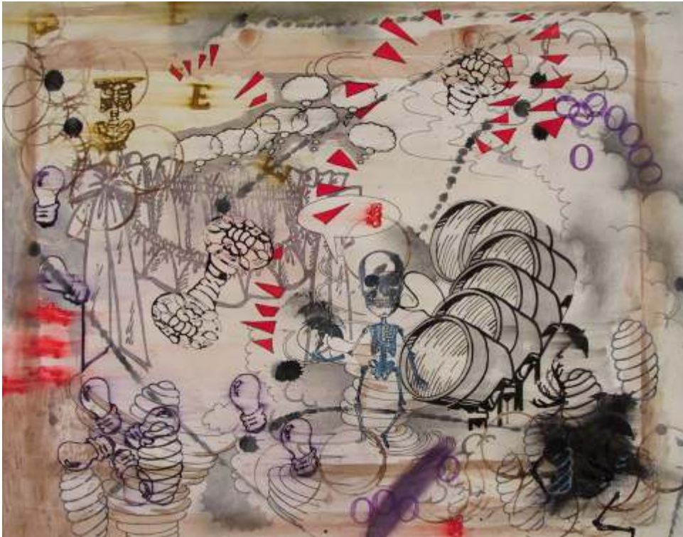
Skeleton with Lights , 2005 acrylic, watercolor, pencil, ink 20 x 25 ½ in