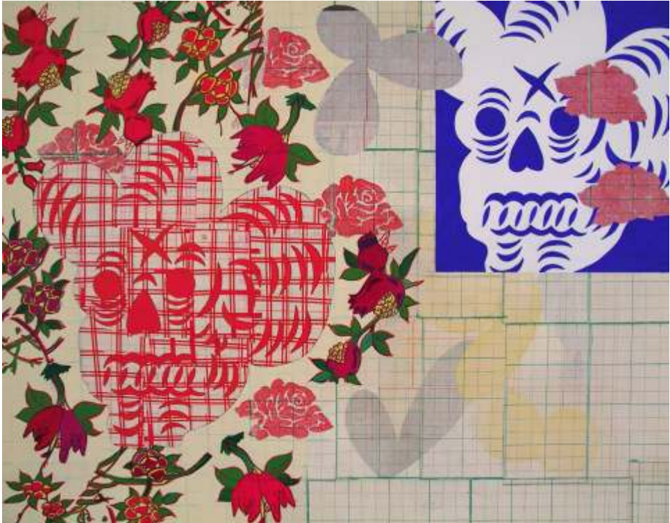
Skeleton, Blue, 2004 mixed media, collage on paper 25 1/2 x 31 1/2 in