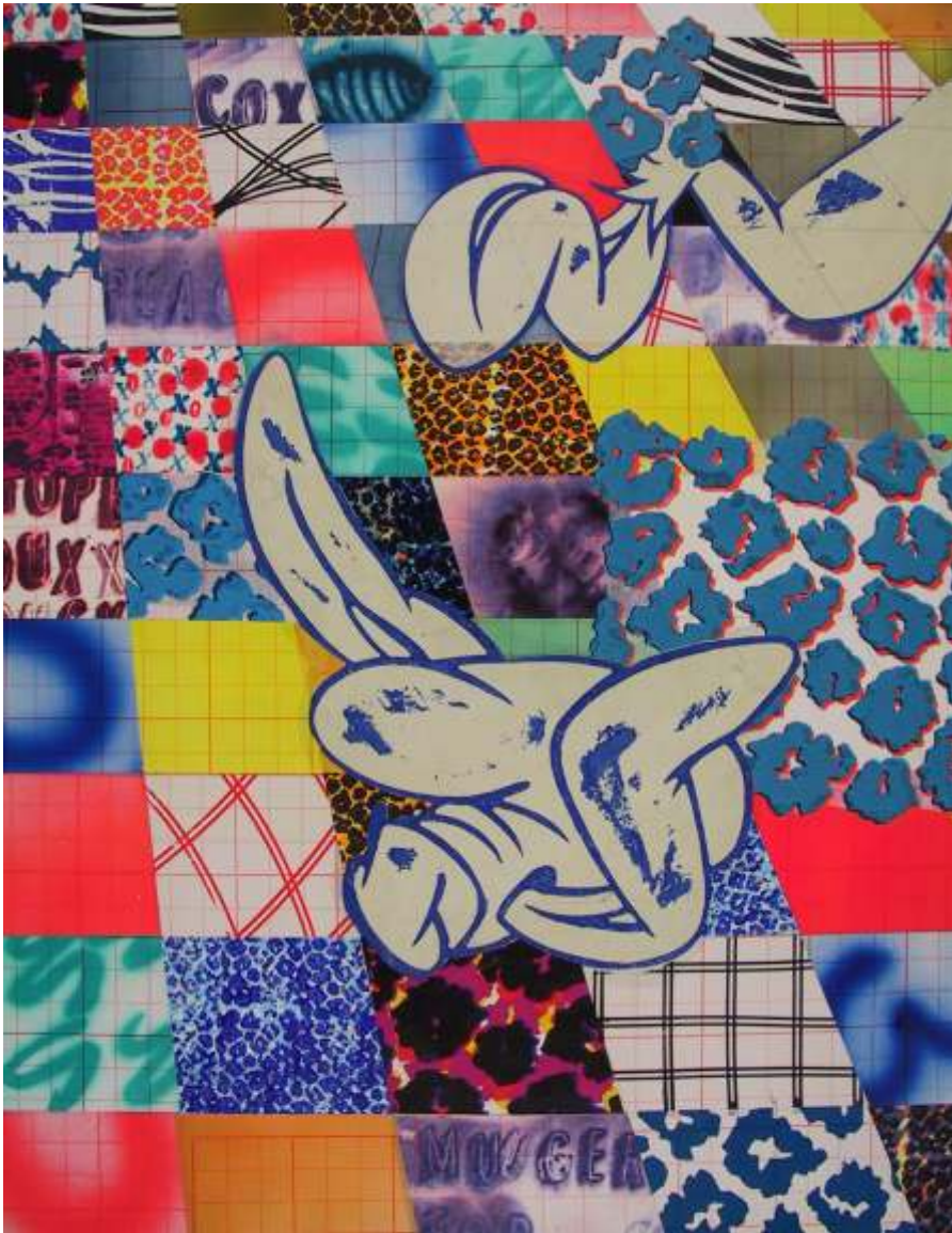
Untitled 02D113, 2002 mixed media, collage on paper 28 1/8 x 22 3/4 in