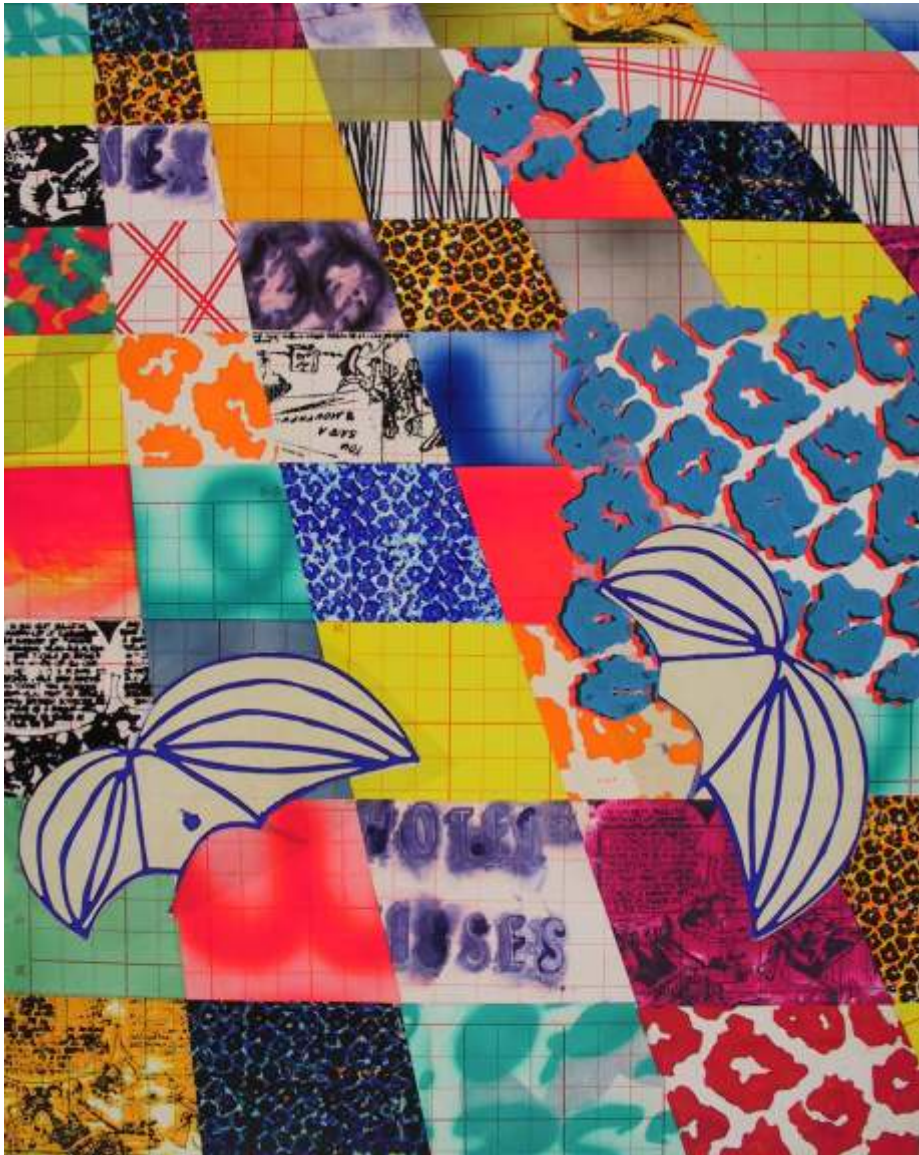
Untitled Checkerboard, 2004 mixed media, collage on paper 29 ¼ x 23 in