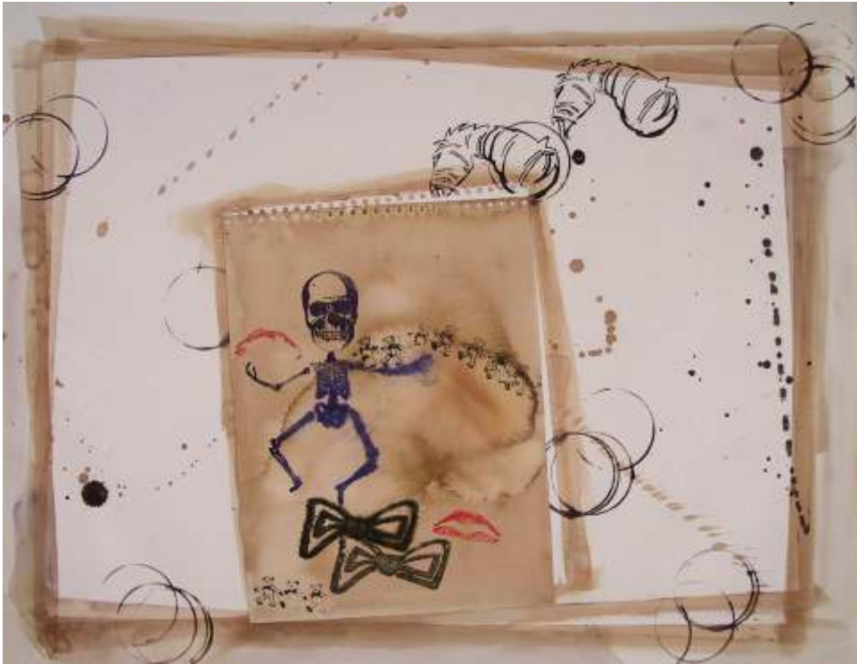
Untitled Skeleton, 2005 collage on paper, watercolor, acrylic 20 ¼ x 25 ½ in