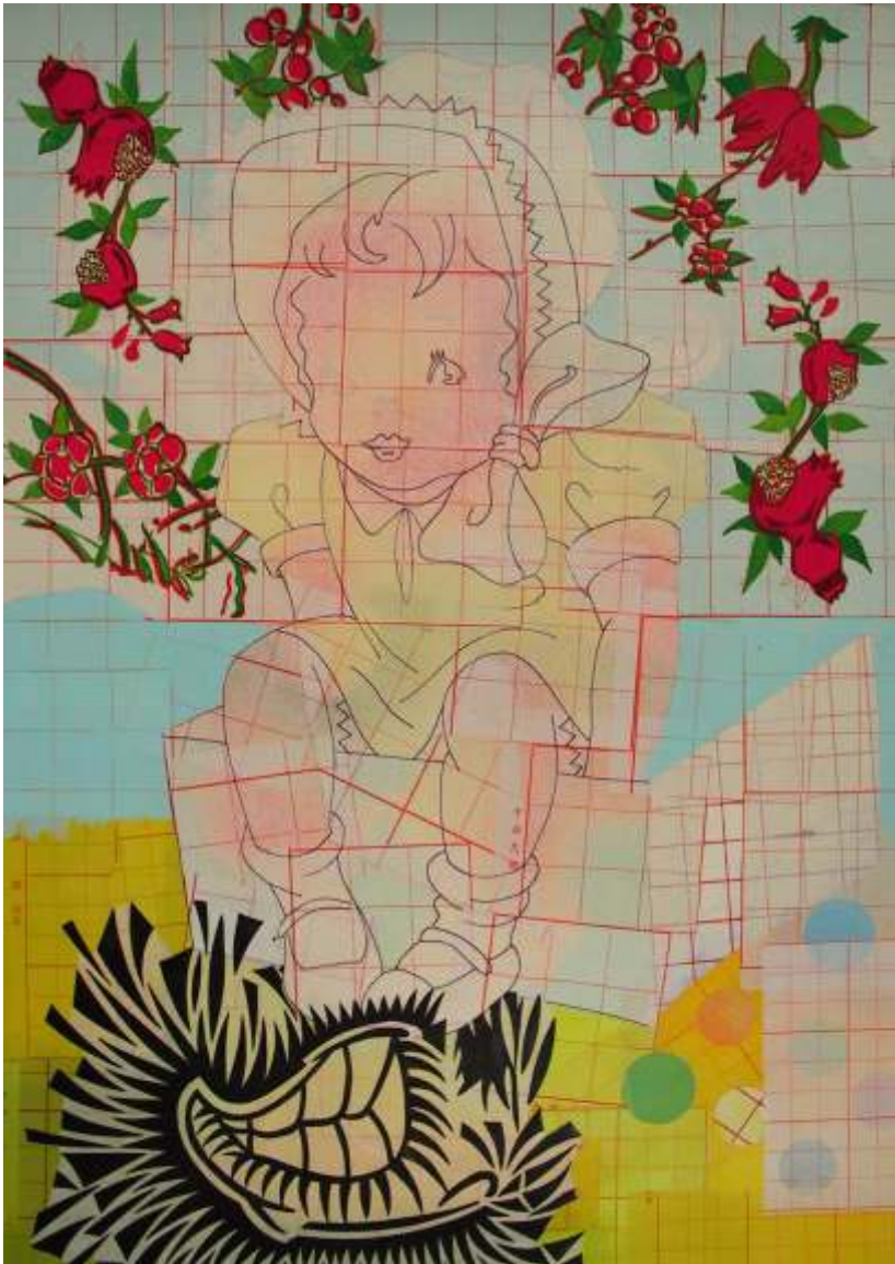
Girl in a Box, 2005 mixed media, collage on paper 29 ¼ x 23 in