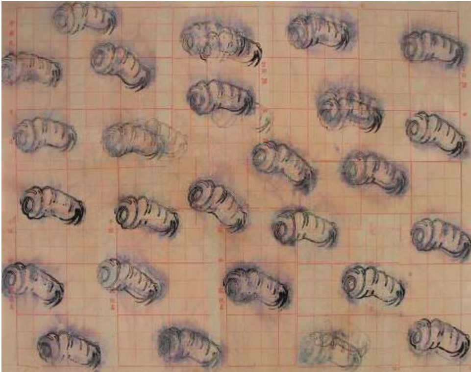
Untitled Checkerboard, 2004 acrylic on rice paper 17x 21 3/8 in