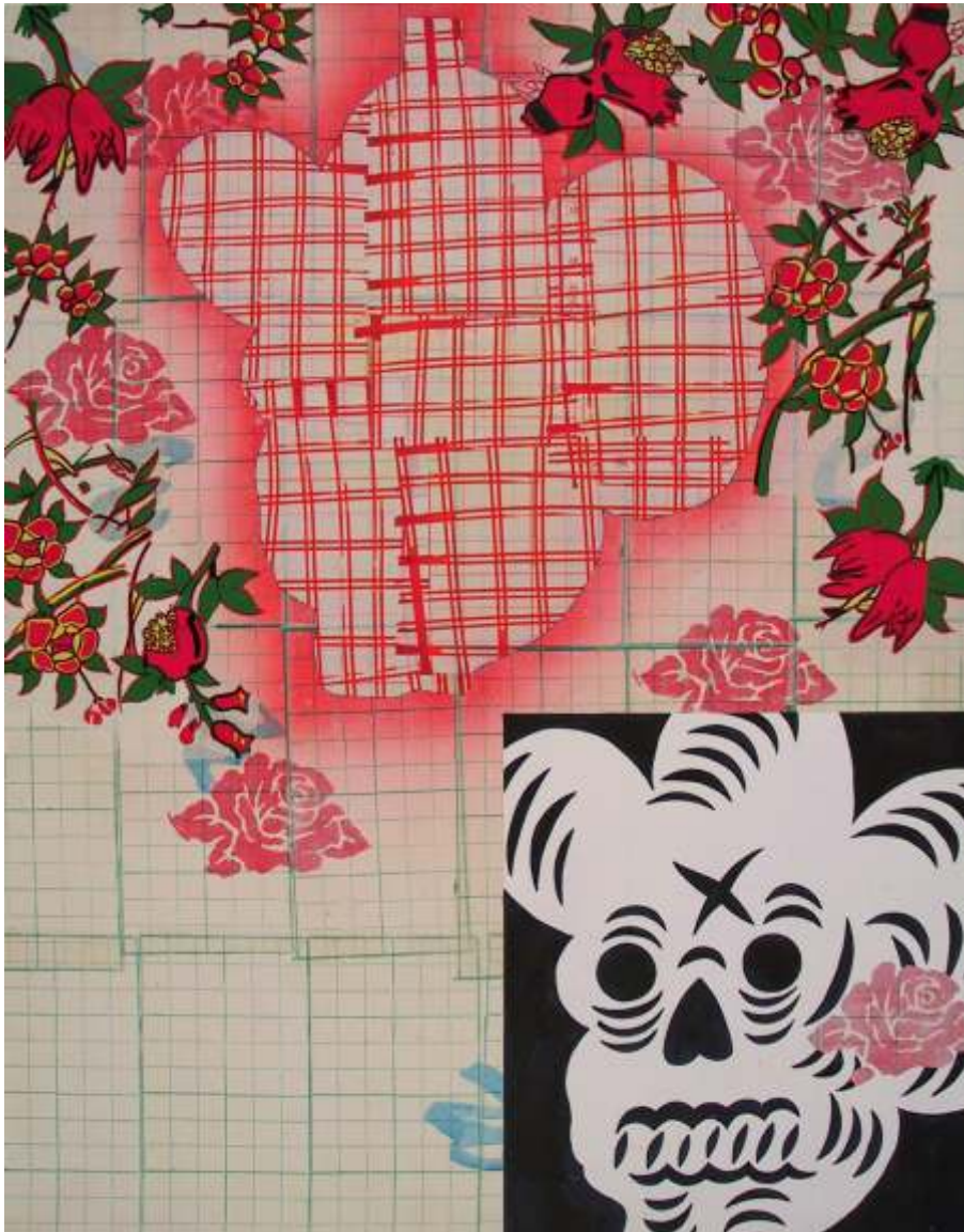
Skeleton, Black, 2004 mixed media, collage on paper 29 ¼ x 23 in